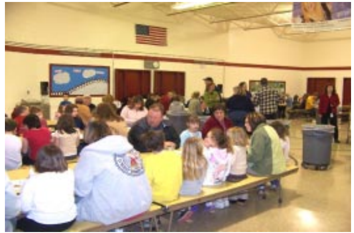
Parents enjoyed eating breakfast with their children and the Brege Family as part of reading month.